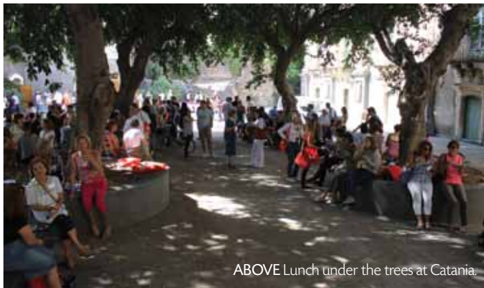
ABOVE Lunch under the trees at Catania.

The study of Roman pottery can seem an isolated and dreary occupation at times, when one is shut away in a museum store with endless crates of potsherds. However, meetings such as those of the RCRF, with their very high participation levels – around 90% of those attending present papers or posters – remind us that it is nonetheless a dynamic field of enquiry that can significantly enrich our understanding of Roman history and daily life. ■