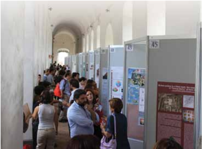
BELOW The poster session is another important opportunity for discussion. At Catania, there were over 80 on display.

The length of the congress and the provision of communal meals in the middle of the day foster academic and social exchanges. Other consequences are apparent to the extent that members who used to work in – and report on – researches in their home region are increasingly presenting papers about research in quite different parts of the Roman world: it is clear that the relationships formed at these meetings are leading to new collaborations between scholars from different countries.